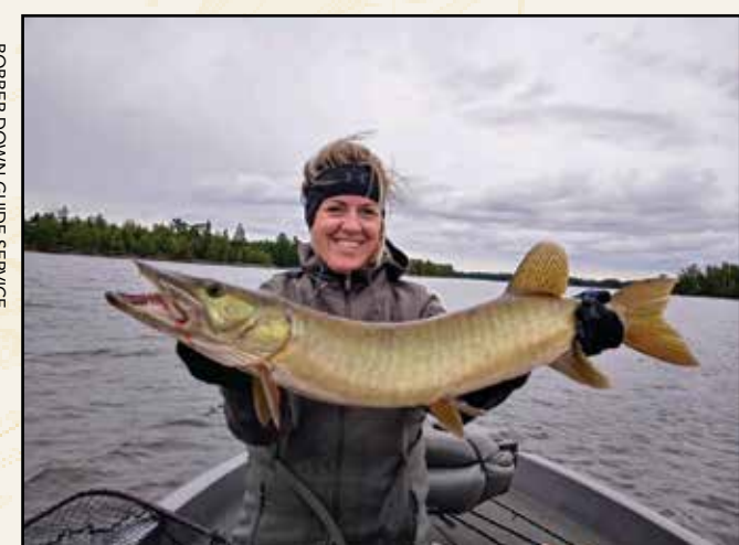
BOBBER DOWN GUIDE SERVICE

For detailed information, contact individual advertisers WISCONSIN'S SCENIC WILDERNESS WATERS AREA Turtle - Flambeau Flowage Association www.turtleflambeauflowage.com