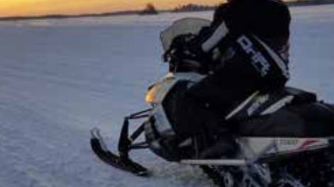
MERCER AREA CHAMBER OF COMMERCE