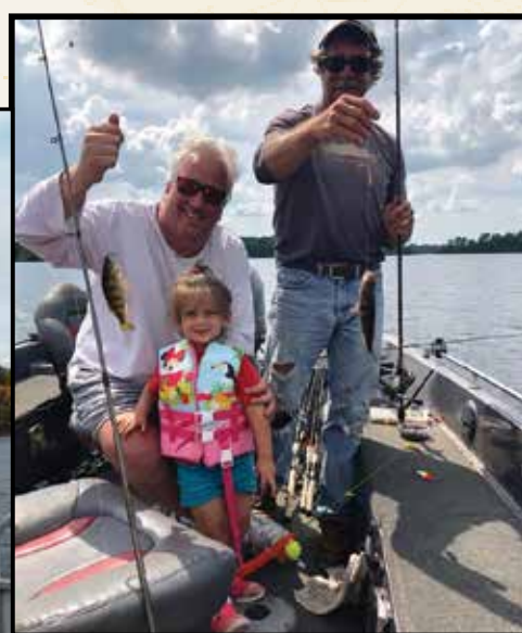
BOBBER DOWN GUIDE SERVICE