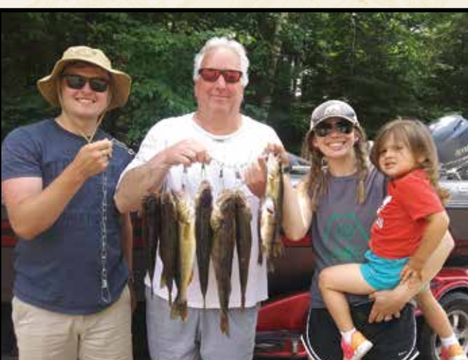
BOBBER DOWN GUIDE SERVICE