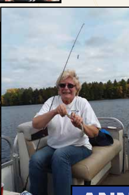
FLAMBEAU VISTA RETREAT