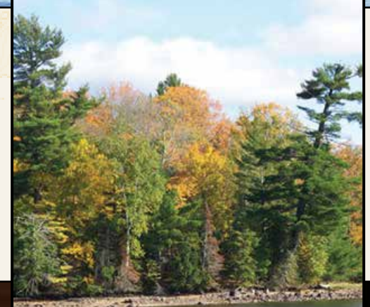
WES MEDDAUGH FAMILY